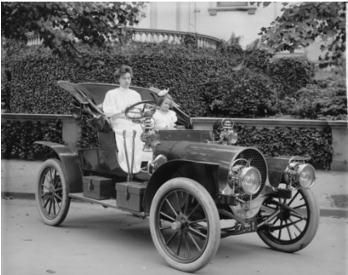
Figure 1: Example figure

An example of the Figure 1, which also uses cross-reference. The style should be switched to Normal.